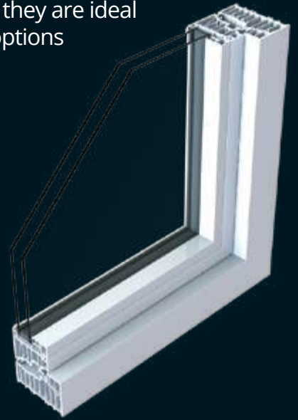
100mm 9 chambered energy efficient profile achieving 0.79 W/m 2 k U-Value for 28mm double glazing or 44mm triple glazing