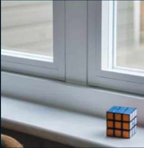
Very clear design with a cutting edge internal shape it is unconventional and unique

Flush2 is the architectural highlight of the Residence Collection, with clean lines and superb performance. With a flush external casement design and a square edge internal finish they are ideal when replacing 100mm traditional timber windows. A choice of styling options make them suitable for period and modern properties.