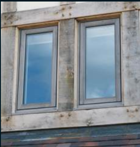
New complementing the old