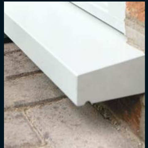
55mm Radlington cill option