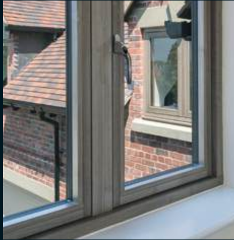
Straight lined innovation, bold looks create a bright living environment