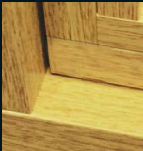
Feels elegant and timeless for those wanting a contemporary look in a traditional building